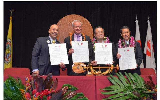
Just after the signing at Mission Memorial Auditorium