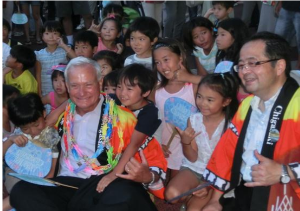
Honolulu Mayor Kirk Caldwell being greeted by the children of Chigasaki at the welcoming ceremony.