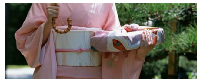
The traditional way - dressed in your best kimono, hand-delivering your gift wrapped in a furoshiki cloth.

The custom of Ochūgen has been in decline in recent years, with some preferring to express their gratitude to others at the end of the year. Of course, what's most important are the relationships we have with others, but there's a special feeling to giving or receiving a gift at any time of year, isn't there?