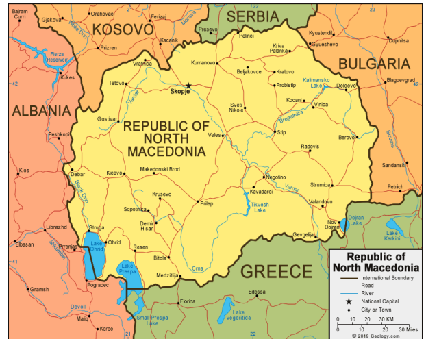
Map of the Republic of North Macedonia

The Host Town Initiative is a program the Japanese Government made for the Tokyo 2020 Olympic and Paralympic Games. The purpose of this program is to make Japan a sports-oriented and globalized country, to promote regional revitalization, and to develop the tourism industry. As a host town, Chigasaki will be engaged in many cultural activities and economic interactions with a long-term goal of strengthening ties between host towns, cities and their guest countries. Let's give all the athletes and staff a fantastic and warm welcome!