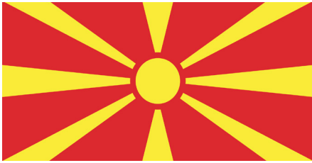
Flag of the Republic of North Macedonia

On April 26, it was announced Chigasaki City will be a host town to the Republic of North Macedonia.