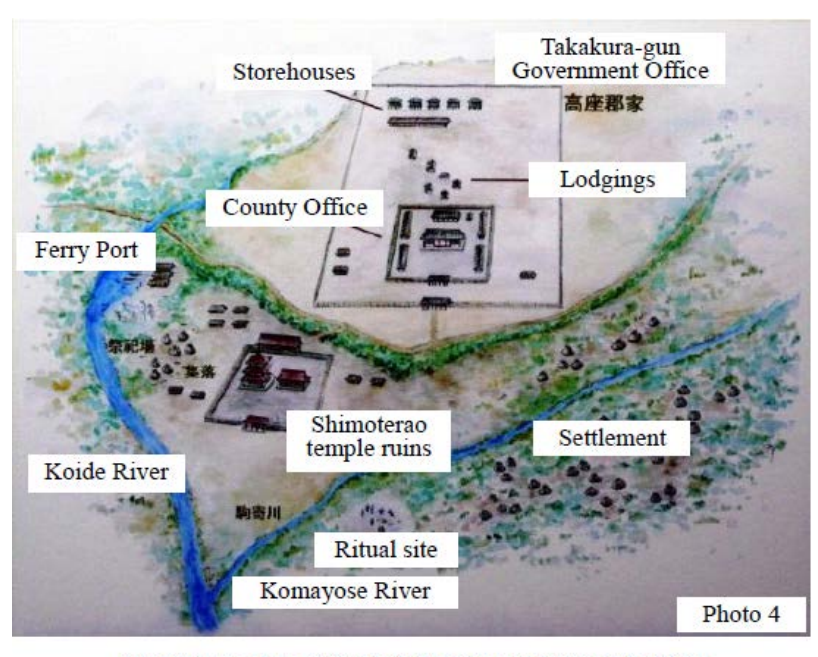
Illustration of ancient Takakura-gun government facilities. (Producer: Masatoshi Tao, Illustrator: Ayano Shimoide)

A so-called shichidō-garan -style temple typically consists of seven buildings or facilities, namely the main hall, a lecture hall, a tower with multiple layers, the bell tower, a storehouse of sutra (Buddhist scriptures), accommodation for Buddhist monks, and a dining hall, though the combination or construction of such temple compounds is said to vary according to the religious sect and era. The temple at this site existed from the end of the 7th Century until the early 11th Century. Some say the temple belonged to a powerful local family, and others say it was the county temple, because a temple and a gunga were normally built together in Kanagawa.